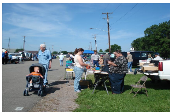
A look at some of the out-side vendors