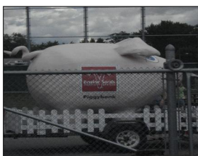
A few of the other entries in the Italian Festival Parade

Most of the time, we as Amateurs, write our Senators or House of Representatives complaining that a certain Act or Bill will not be good for Amateur Radio.