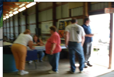
The inside Club Information Table