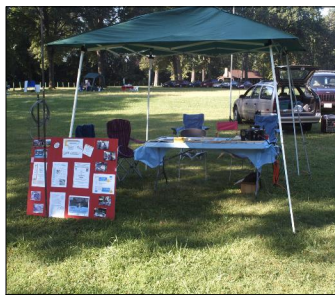
Our display for Warren's First Night Out