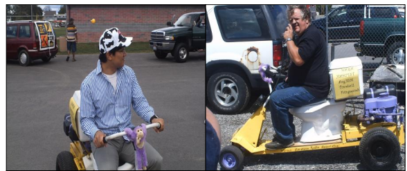
The Hamfest Buggy hit of the events