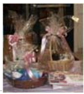
Beautiful Baskets foe the Auction