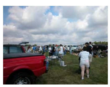
View of our hamfest flea market area