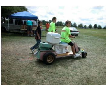
Boy scouts having some fun after our hamfest