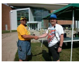
Youth scanner winner with KC8VYS