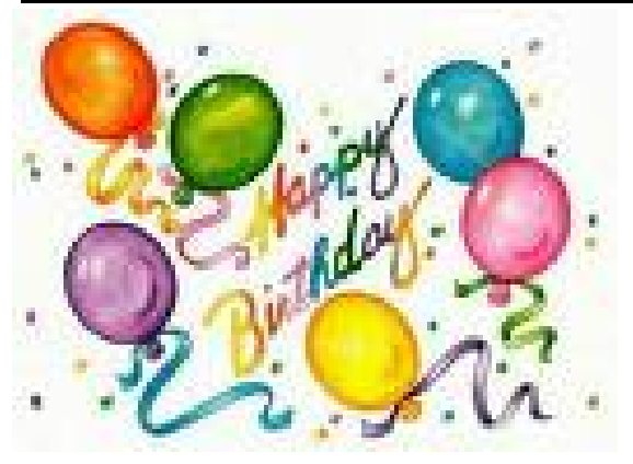
Happy Birthday form the WARA to all of you. Hope you have a wonderful day.